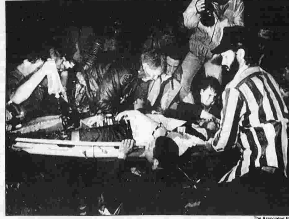
PULLED FROM RUBBLE — Rescue personnel and volunteers take a survivor from his car buried under the rubble from a shopping center in Huntsville, Ala., Wednesday night after tornadoes ripped through the area.

NOV FILMED BY THE PROFESSIONALS AT CREST MICROFILM, INC., CEDAR RAPIDS, IOWA 1989