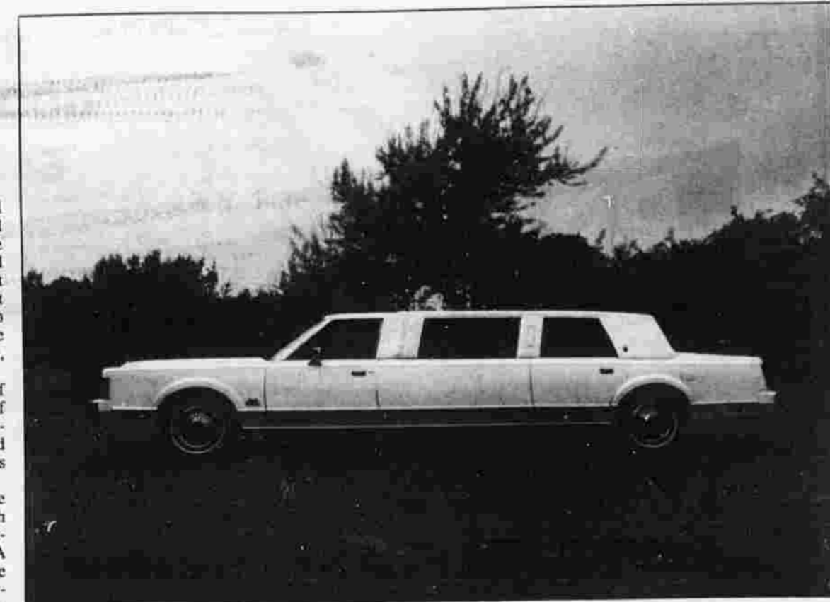
LEADING THE PARADE — A limousine from A & A Livery Services will lead the Product Show's auto parade on Thursday.