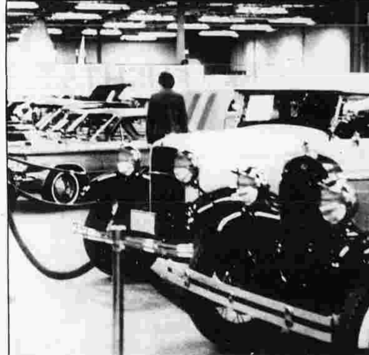
OLD CARS — Visitors to the 1985 Product Show view a collection of antique automobiles.