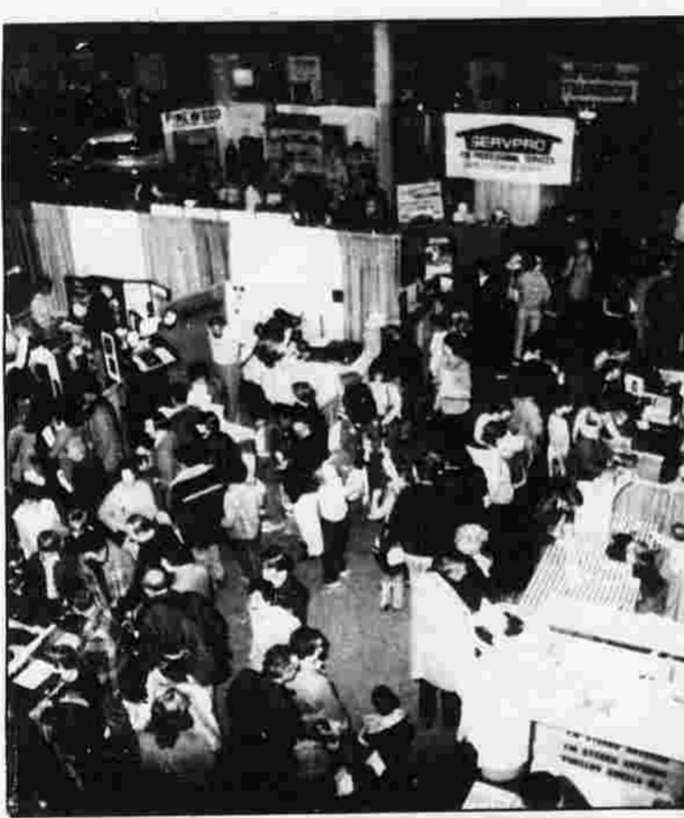
MINGLING CROWD — A large crowd gathers at the 1985 Product Show at the SNET Building on New State Road. It was the last show that was held in Manchester.